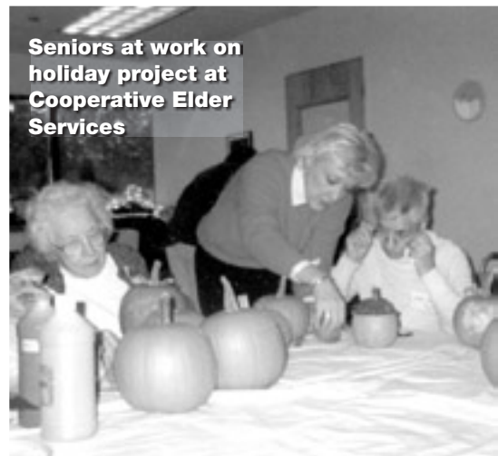
Seniors at work on holiday project at Cooperative Elder Services

We provide critical support to many local health and human service agencies. Without our help, many agencies would have to cut programs; others would have to turn away clients; and some agencies would struggle simply to keep their doors open.