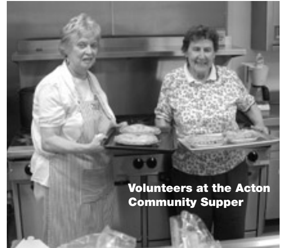
Volunteers at the Acton Community Supper

We hope you will think carefully about the important work we do here in our community and become a contributor to YOUR local United Way.