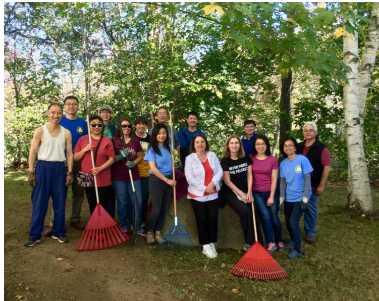
ACACS and OMR at Acton Housing Authority

To view a video of the day's events, please visit: ActonTV .